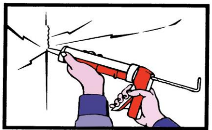
\label{paracryl} \textbf{PARACRYL EXTERIOR S} \ \text{is rainsave already after 1 hour, highly suitable for outside use.}